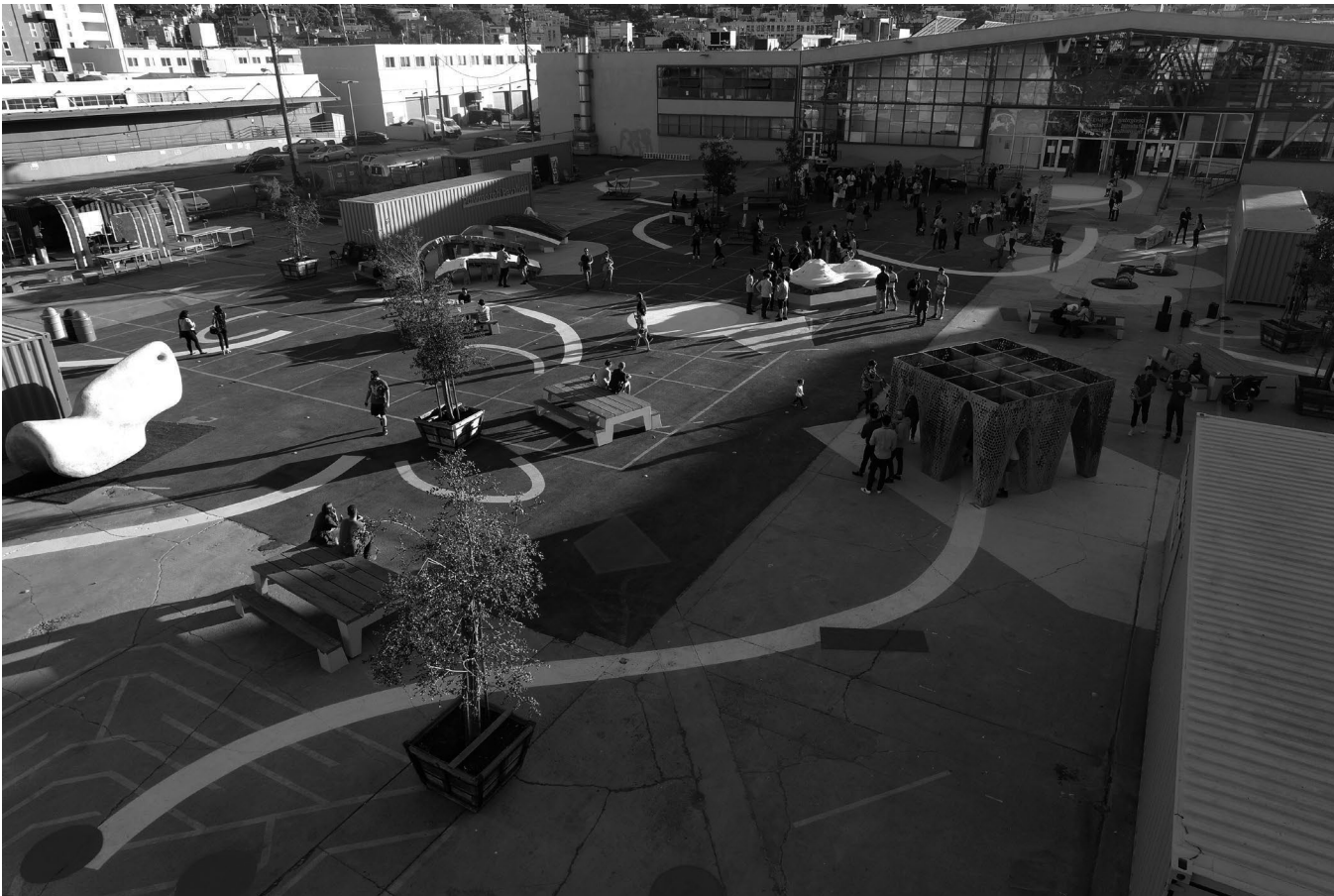
Figure 3: Social event.

than the urban context of San Francisco itself. This urbanism is not picturesque. Though it is spatially ambient and immersive, it is best comprehended in plan view. In fact, it is a kind of urbanism that most literally occupies and activates the plan drawing, though it accommodates erasures, additions, or alterations to the 1:1 drawing as the terms of its urbanism are edited from both top-down (the institution) and bottom-up (the student body).