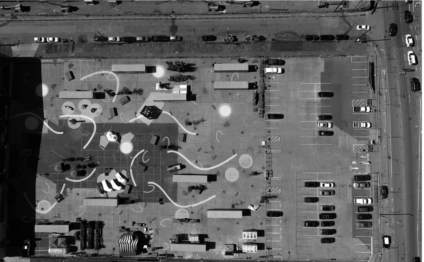
Figure 4: Confetti Urbanism aerial view.

Confetti Urbanism offers alternative organizational and aesthetic principles that can be co-opted and understood through varied other contexts, be they urban or otherwise. What Confetti Urbanism suggests more broadly is that loose, fleeting, and informal organizations can also be precise in their intent without forgoing spontaneity, individuality, and opportunities for appropriation.