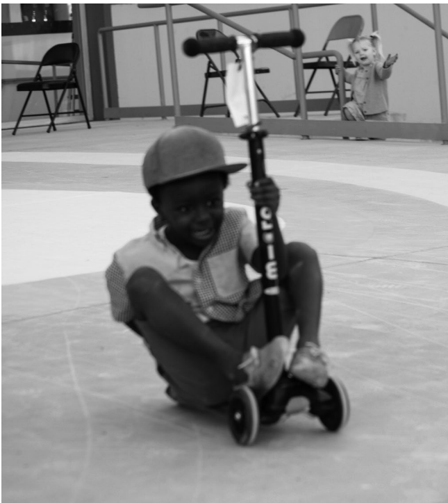
Figure 2: Kids playing

At California College of the Arts, a 73,470 square foot Back Lot behind the college is where much of this institutional stuff is housed. In September 2017 this almost 2 acre Back Lot was host to an exhibition curated by then CCA Architecture Dean Jonathan Massey showcasing full scale architectural prototypes with the roll of exhibition designer played by yours truly. This was an atypical site for an exhibition design. At once display venue, work yard, and social space, the Back Lot is equipped with at the time ten, (now 12) 40'-0" shipping containers for storage, a material reuse depot, a facilities management outpost, a welding and casting station, forklifts, an Airstream trailer, picnic tables, benches, umbrellas, portable basketball hoops, trees in planter boxes, trash cans, a working garden, hammocks, and random debris from